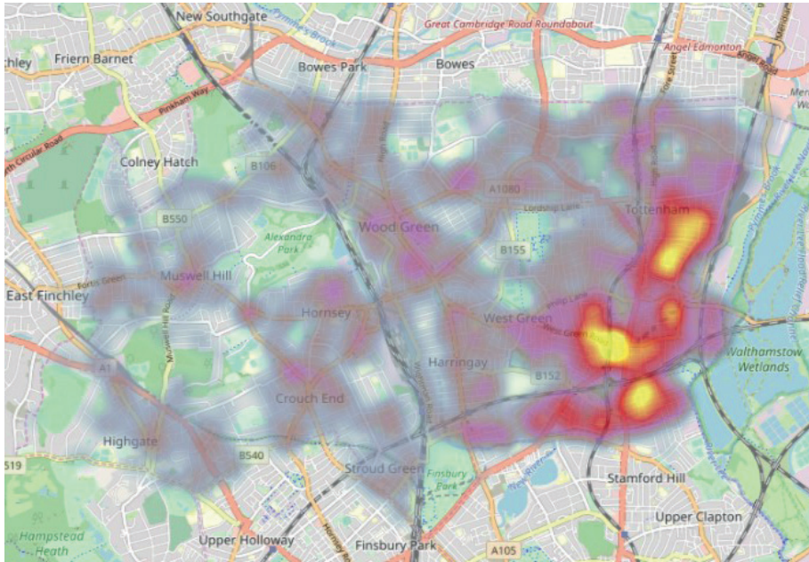
Map of Haringey showing fly-tips reported in the borough during 2017/18

The map below shows that whilst fly-tipping occurs in areas all over Haringey, the corridor down Tottenham High Road has the highest levels of fly-tipping. More fly-tips also occur in West Green and in Wood Green.